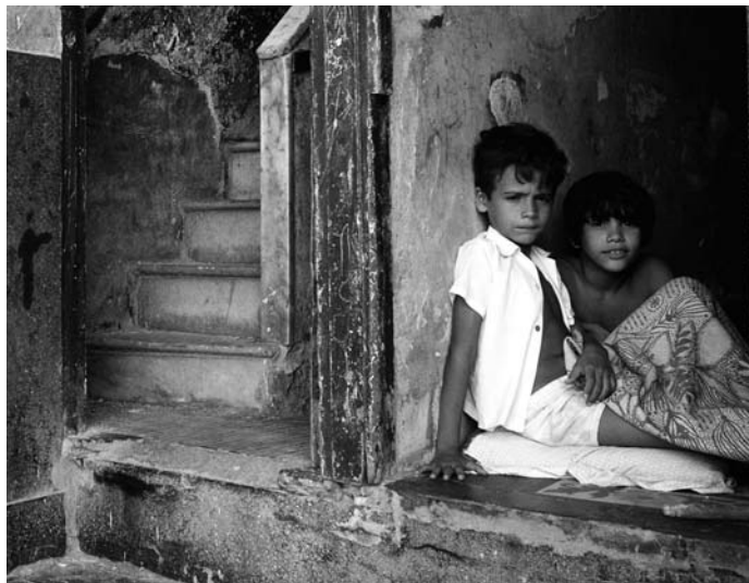
The discounted cash flow approach implicitly compares private return available in the financial market with the social return available from grants to charities, such as schools and soup kitchens.

Third, the McKinsey authors are correct in recognizing that there is a social opportunity cost of forgoing earlier grant mak-